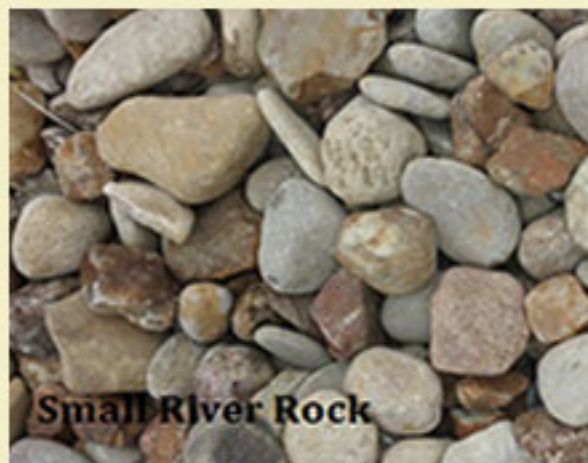
Small River Rock