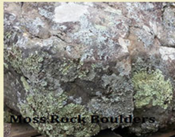
Moss Rock Boulders