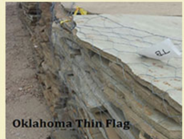
Oklahoma Thin Flag